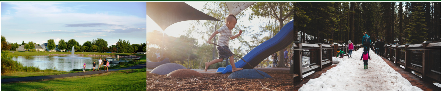
Stats in sidebar are based on 2013 results from "Economic Impact of Local and Regional Park Agencies' Spending" study, conducted for the National Parks and Recreation Association by the Center for Regional Analysis at George Mason University.